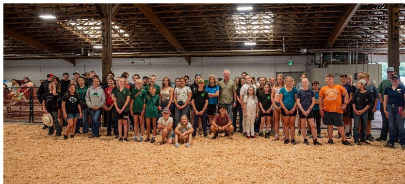
(Opening Ceremonies 2024)

Abbotsford Agrifair is a not-for-profit, registered charity operated by a volunteer board of directors working with office staff. The board extends a big thank you to the City of Abbotsford for its strong and continuous support, to the Province of British Columbia, to our sponsors, volunteers, and, of course, to all of you who attend the fair.